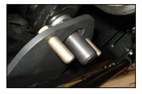
7. Install two ½" bolts through the holes in the bearing mounting plate so the threads extend through the bracket.

8. Install bearing over the sector shaft nut and bolts until it comes in contact with the support bracket.